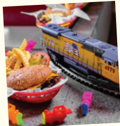
2 Toots Train Whistle Grill