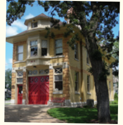
Elgin Fire Barn No. 5 Museum

Before hitting the road to go back home, there are two restaurants in the Dundee area that kids absolutely love. Van's Frozen Custard and Burgers is a local favorite for both their burgers and custard options. Walking distance from the Dundee riverwalk, this location makes for a great place to stretch and walk before getting back into the car. Another top spot is Woodfire Dundee , which serves mouth-watering classic woodfired pizza (which kids love), but also features wine on tap (which may be of interest to parents).