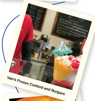
Van's Frozen Custard and Burgers