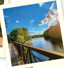
Fox River Trail