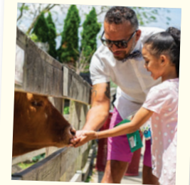
Randall Oaks Zoo