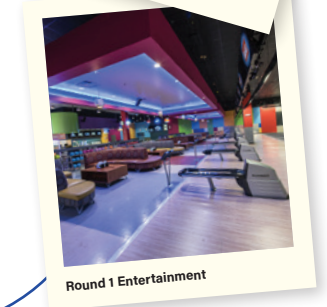
Round 1 Entertainment