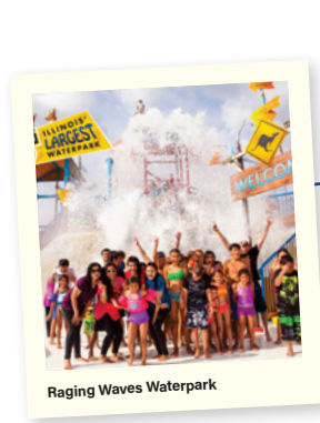
Raging Waves Waterpark