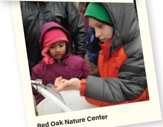
Red Oak Nature Center