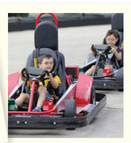
Sugar Grove Family Fun Center

Many attractions have reopened with limited capacity or different operating hours. Inquire with attractions ahead of time for up-to-date travel policies and health and safety information.