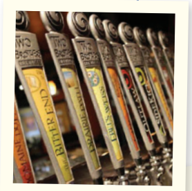
Two Brothers Roundhouse

Find breakfast bites and Harner's donuts at Moka, a drive-thru cafe on the Lincoln Highway. Enjoy the petting zoo and farmstand goods at Abbey Farms , and take a step back in time at Blackberry Farm , a living history museum. Shop exclusive deals on designer goods at Chicago Premium Outlets . Locals love the pizza at Ach-n-Lou's, a favorite for generations of Aurorans just south of the outlet mall. Go bowling and enjoy the region's largest arcade at Round 1 Entertainment at Fox Valley Mall. A kid-friendly menu and more of the Aurora Area's finest craft beverages can be found for dinner at Hopvine Brewing Co. Relax with a stay at Homewood Suites by Hilton Aurora.