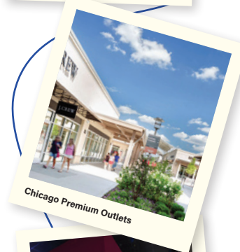
Chicago Premium Outlets